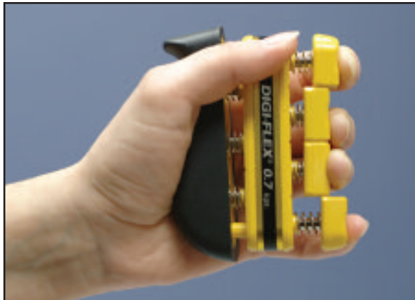
Digiflex – device used to increase hand strength

Services rendered through occupational therapy are typically covered by Medicare, Medicaid, The Bureau of Worker's Compensation and most other medical insurances.