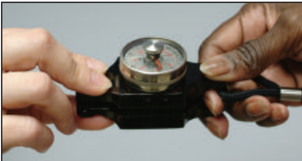
Pinch gauge – measures pinch strength