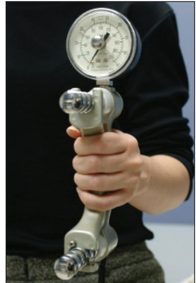
Dynamometer – measures grip strength

For further information or to schedule an appointment, please contact the South Pointe Hand Therapy Program at 216.491.6180.